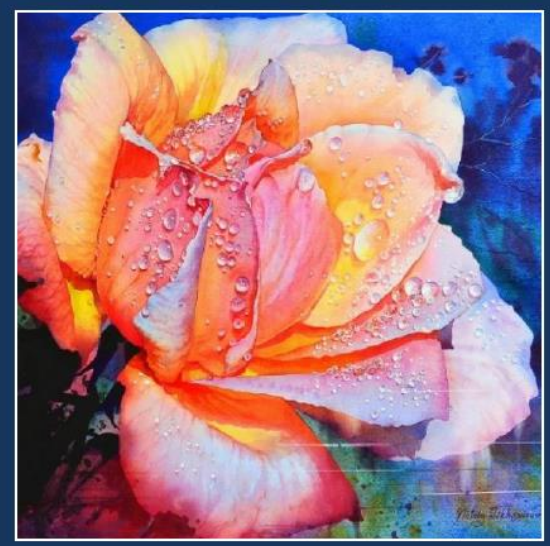
NATALY TIKHOMIROV watercolors