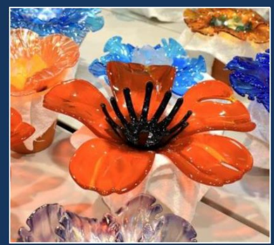
KATIE SHULTE JOUNG glass