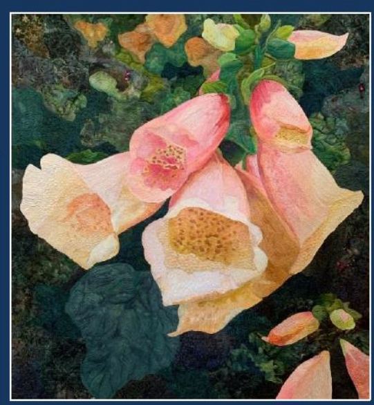
SANDRA MOLLON textiles

GALLERY AT 48 NATOMA September 8 to November 8, 2023