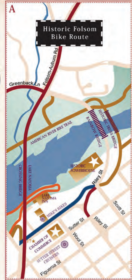
Historic Folsom Bike Route