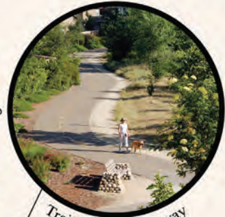
Trails in The Parkway