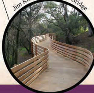
Jim Konopka Volunteer Bridge

Folsom Plan Area Additional trail segments planned for future development