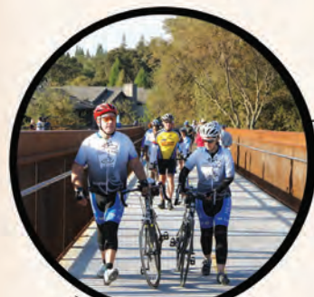
East Bidwell Overcrossing

*Bike lane in south-west bound direction only between Natoma Station Drive and Blue Ravine Road.