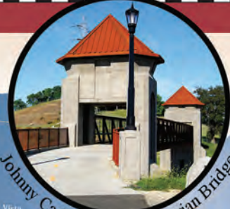
Johnny Cash Trail Bike/Pedestrian Bridge