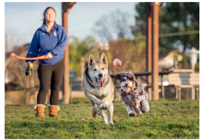
FIDO Field Dog Park 1775 Creekside Drive

Folsom Parks & Recreation maintains 48 developed parks in the city, featuring a variety of recreational amenities including playgrounds, walking paths, sports fields and courts, and picnic areas. Folsom is home to more than 50 miles of Class I recreational trails for cycling, walking, running, and hiking. Access points for the city's trails are located within most neighborhoods and near parks, businesses, and retail centers. Visit www.folsom.ca.us/parks to find a complete listing of Folsom's parks and trail maps.